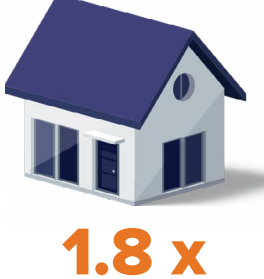
4-6 years of advice